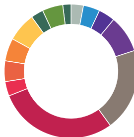
Medium Investment Term

Equities UK Equities Other Fixed Interest Overseas